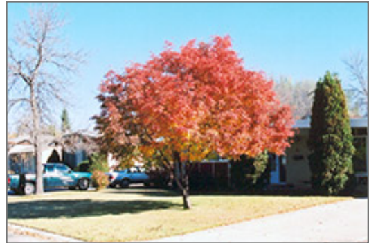
Showy Mountain Ash in fall