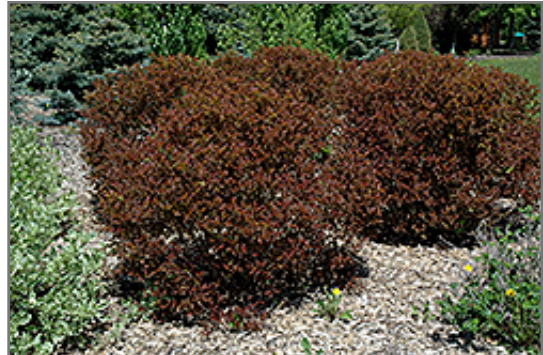
Summer Wine Ninebark