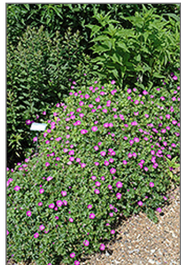
Max Frei Cranesbill in bloom