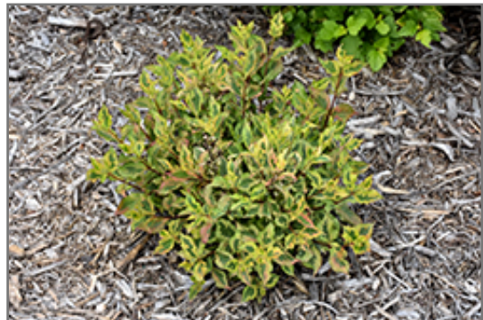
Rainbow Sensation Weigela